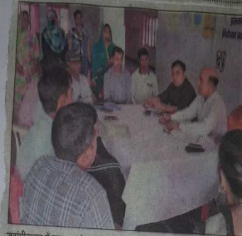
जहांगीरबाद में गुरुवार को जागरूकता शिविर का हुआ आयोजन