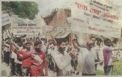
जहांगीरबाद में निकाली गई जागरूकता रैली

मसौली के कई ग्राम पंचायतों में रैली निकाली गई, जिसमें स्वास्थ्य रहने के उपाय बताए गए। विश्व स्वास्थ्य दिवस के तहत प्रसार द्वारा बंकी ब्लॉक के खिजुरपुर, मोहिंदीनपुर, फतेहसराय, चचेरुवा के रैली के माध्यम से जागरूक किया गया। एक साथ अभियान की रैली में 4725 समुदाय के लोगों ने प्रतिभाग किया। रैली के बाद गांवों में बैठक के माध्यम से महिलाओं के प्रजनन स्वास्थ्य व अधिकारों को लेकर चर्चा की गयी। जिसमें कि परिवार नियोजन में पुरुषों की सहभागिता की बात की गयी। साथ ही सरकारी अस्पतालों के निजीकरण पर चिन्ता व्यक्त की गई क्योंकि आज निजी अस्पतालों में मरीजों के साथ बहुत अधिक लुट होती है और सरकार उसकी रोकथाम के लिए कोई मानक नहीं तय कर पायी है। चर्चा में खड़ा गया कि परिवार नियोजन कार्यक्रम में गर्भनिरोधक कार्यक्रम ज्यादातर महिलाओं को प्राथमिकता देती है। वास्तव में नसबंदी कार्यक्रम एक महिला नसबंदी अभियान