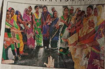
स्वच्छता का संकल्प लेती महिलाएं।

मसौली/बाराबंकी (एसएनबी)। स्वच्छ भारत मिशन योजना के तहत स्वच्छता के प्रति लोगों को जागरूक करने के लिए, राष्ट्रीय रामनाथ कोविंद के आह्वान पर स्वच्छता हो सेवा है के क्रम में गुरुवार को ग्राम पंचायत टोटादीनपुर में महिलाओं द्वारा स्वच्छता संकल्प लिया गया।